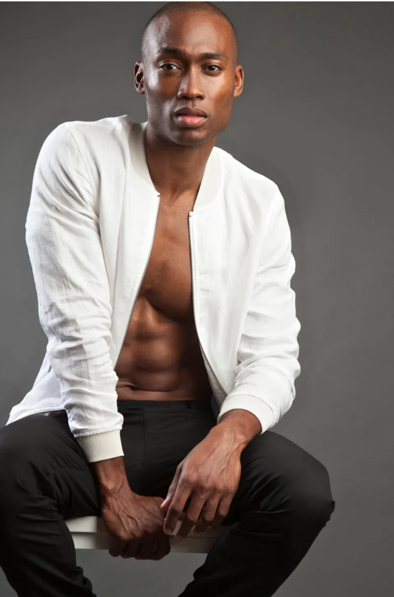
Clean cut + crisp