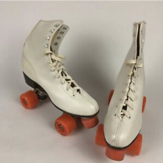
Vintage Roller Skates: $75