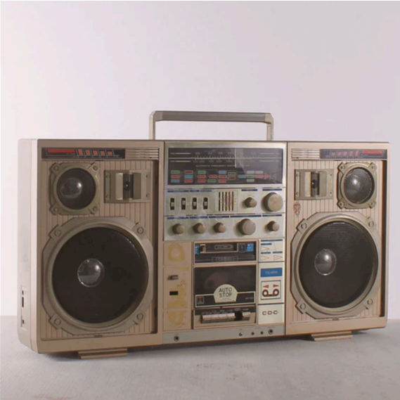
Boombox Gold: $125