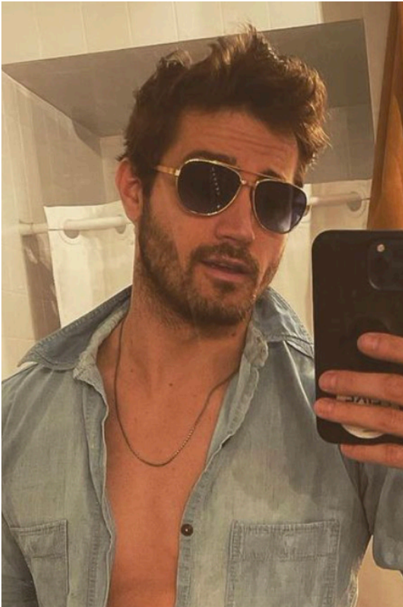
Use product to add dimension and effortless bed head - the perfect imperfect styling.