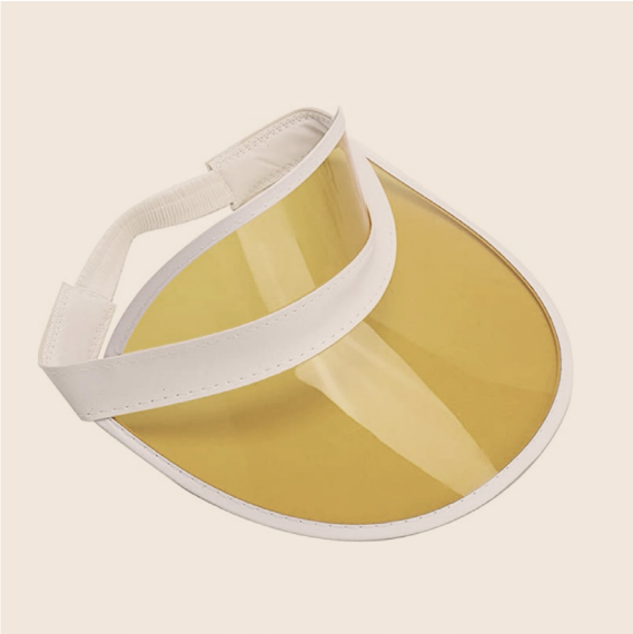
Plastic Visor: $11/each