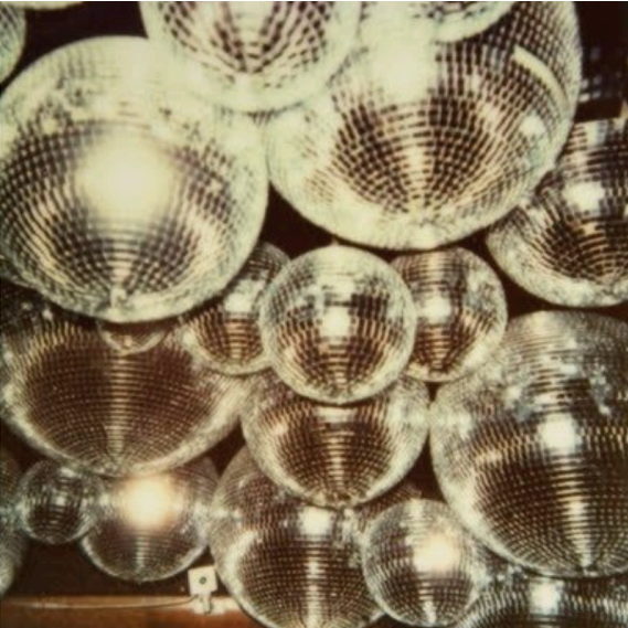
Disco Ball: $30-$425/each