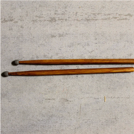
Drumsticks Walnut: $12 [I may have these]