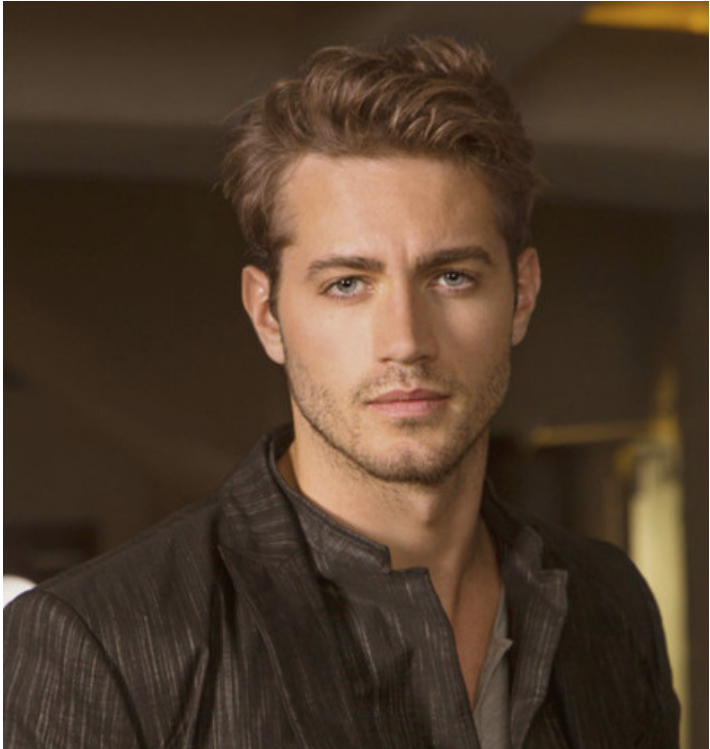
WILL HIGGINS @will_higginson / 70.6K