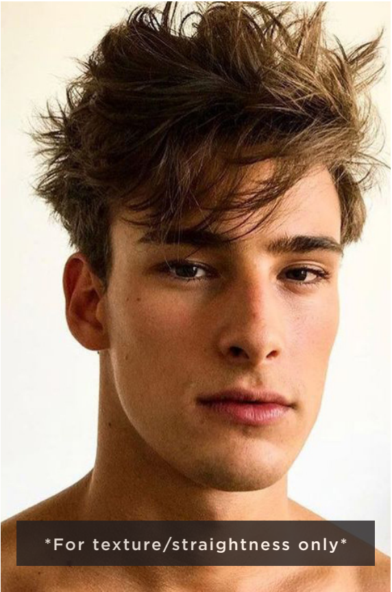
Taking inspiration from 1970s Mick Jagger, straighten the curl slightly while leaving body and fullness - celebrating the updated mullet. Leave the slight 5:00 shadow - not too clean or polished.