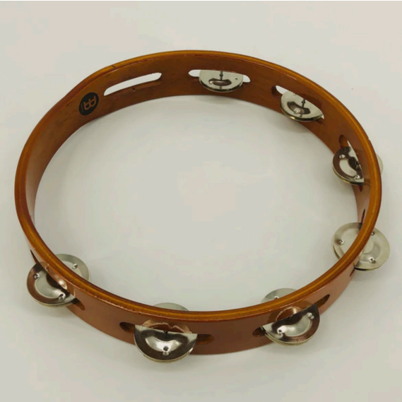
Tambourine Theo: $15