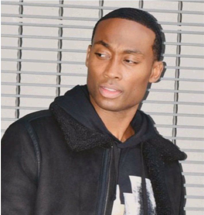
LLOYD DICKENSON @lloyddickenson / 50.3K